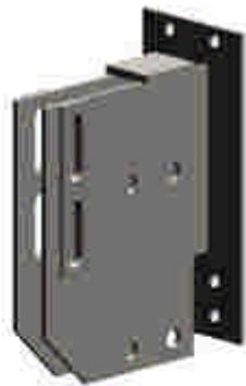
Craneset Adaptor Item # 7187