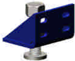
Leveling Bolt Assembly Item # 7147